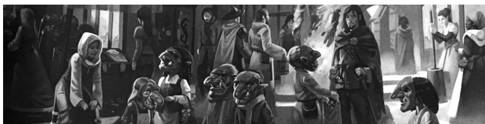
Today is Trolltide, when we celebrate our victory during the Troll Wars. Remember to stock up on treats for the little trolls in your neighborhood.

At this time, there are no details or clues about the perpetrators or how they did it. The thieves obviously used powerful magic. Do not attempt to catch them yourself. Please, if anyone has any information about the stolen artifact, contact Elder Judge Deiter Redd at the Hall of Justice.